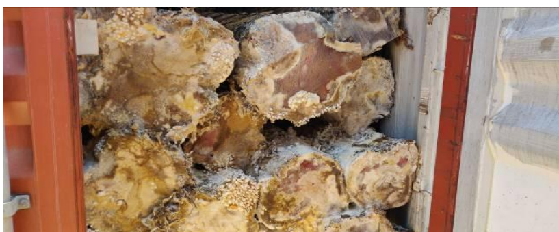
Fig.1c Luxurious fungal growth on timber logs covering core part of the wood logs