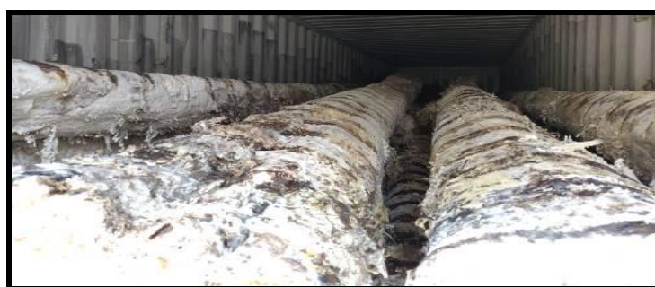
Fig.1b Fungal growth on wooden logs showing discoloration inside the container